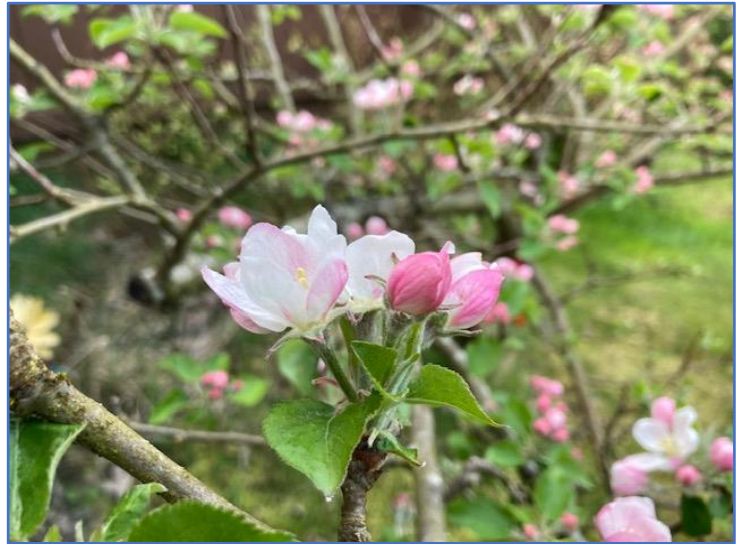
...This Year's Apple Tree

Our Values: As Christian abolitionists, we believe trafficking survivors deserve the opportunity to be restored to dignity and purpose, regardless of their faith or system of belief. As Christian stewards, we prayerfully seek to use wisdom and Biblical guidance for every dollar we spend. As Christian leaders, we seek to inspire change by informing and empowering activists, providing strategic guidance to local shelter and service partners, and influencing policy makers and first responders. Read our Statement of Faith